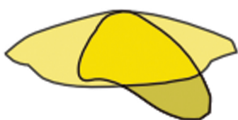
Type II M