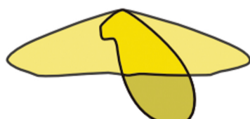
Type III M